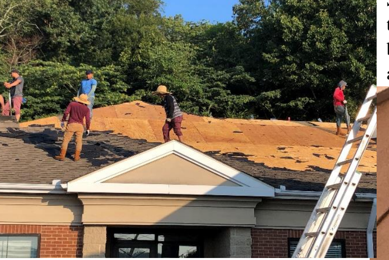
On the outside, a new roofing system was installed. The face of the building was

Scottish Rite, we have taken advantage of this time to make improvements to our building. Here are some pictures of the outside and inside work.